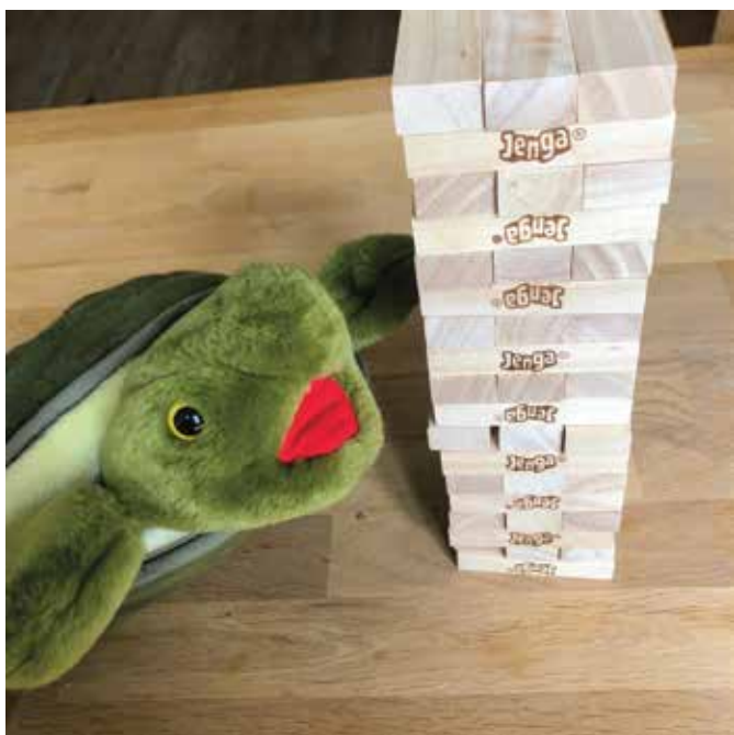
Twiggle says she could play a game with her family.