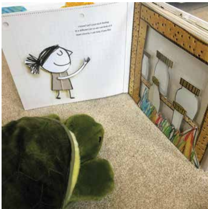
Twiggle says she could read a book.