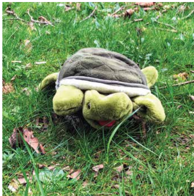
Twiggle says she could play in the garden.